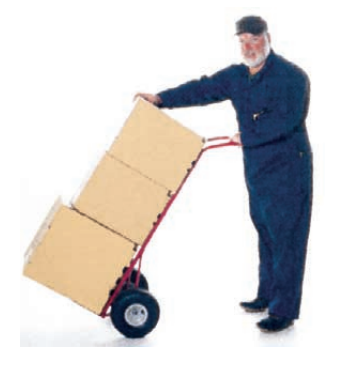
Use a cart.